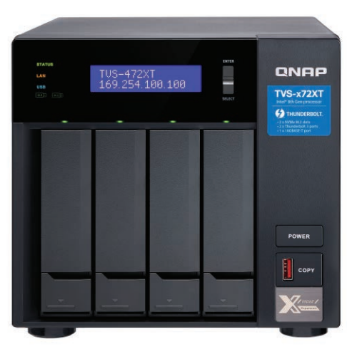
A QNAP server

Although I do not use Jump Desktop for work, I do use it for personal tasks and highly recommend it. It was an easy option to use to help my parents and inlaws when they ran into problems with their computers. With that said, I recommend that you avoid doing the same, because it does not take long before you will be the one whom everyone calls to fix their computer when it runs out of battery.