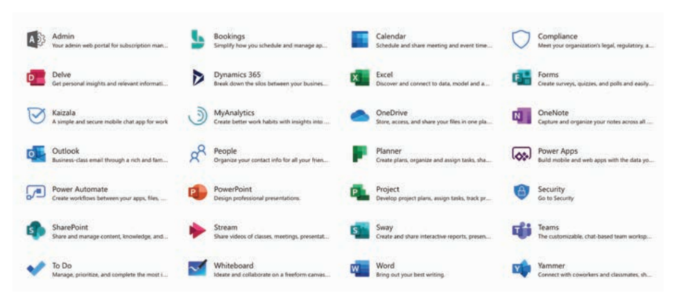
The MS Office 365 subscription service provides a rich suite of products for law offices.

One third-party "add-on" is particularly useful in the calendaring